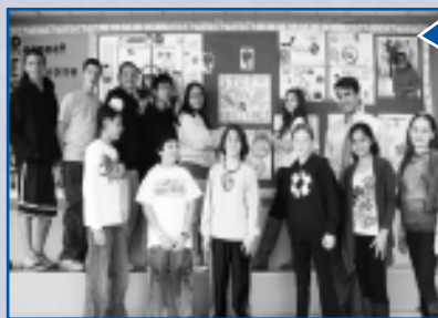
The winning poster contest MAP group