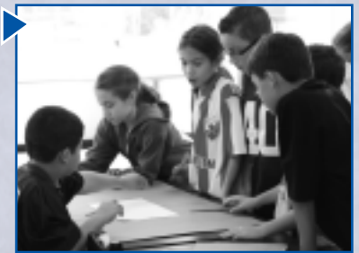
Fifth grade students work on the final stage of the articulation process.

As the students engaged in conversation, they listened to songs that emphasize the importance of developing good relationships, including "With a Little Help from my Friends," "Why Can't We Be Friends, and "We're Going to Be Friends." Afterward, everyone received scissors, glue, pencils, construction paper, markers, and crayons and created projects on the theme of friendship in cooperation with others seated at their tables.